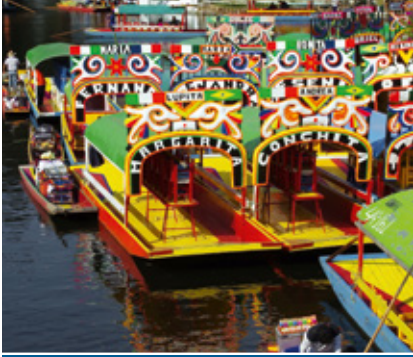
Colourful boats in Xochimilco